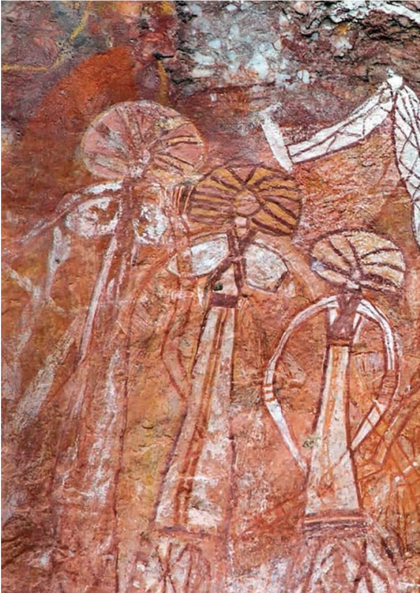
Australian Aboriginal rock art depicting "Star Visitors" (also called "Sky Beings") are similar to the Native American "Star People."