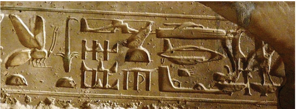
The famous "Helicopter Hieroglyphs" at the Temple of Seti I in Abydos, Egypt.

Ancient Egyptian hieroglyphs and reliefs contain numerous depictions of disk-shaped objects and unusual aerial phenomena . The famous "Helicopter Hieroglyphs" at the Temple of Seti I in Abydos have generated particular interest.