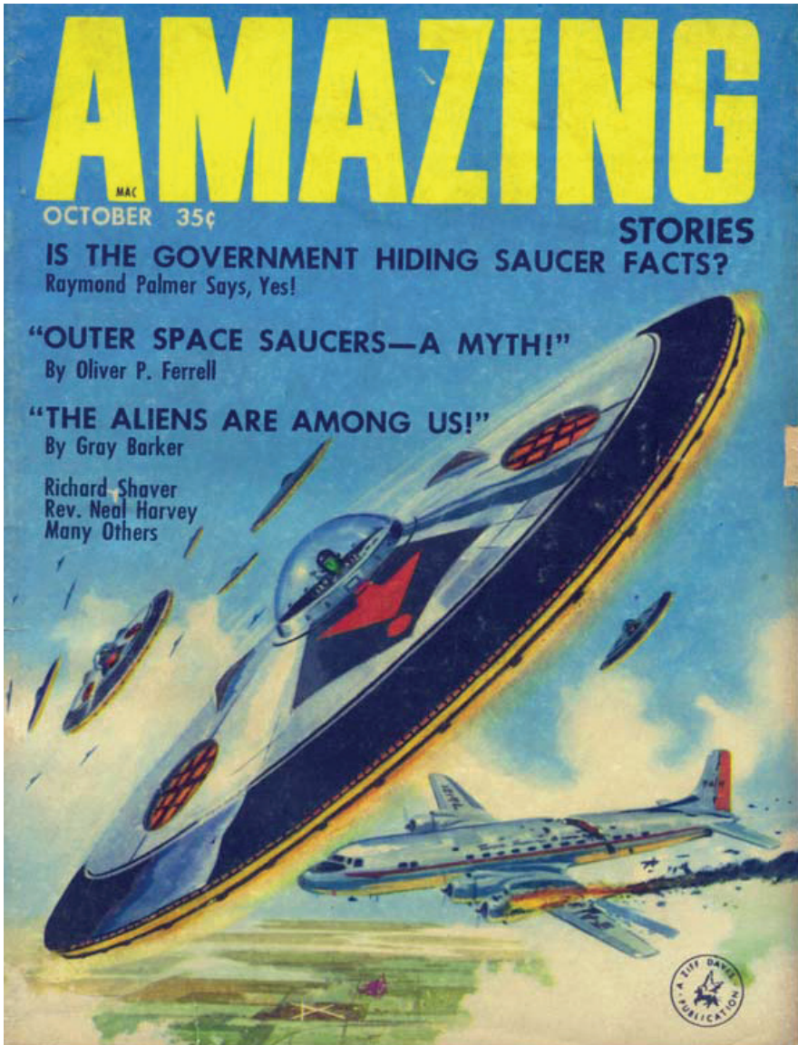
This is the October 1957 cover of the pulp science fiction magazine Amazing Stories . This was a special edition devoted to "flying saucers", which had become a national fad following the 1947 sightings of saucer-shaped flying objects by airline pilot Kenneth Arnold and others, inspiring US Air Force investigations such as Project Blue Book.