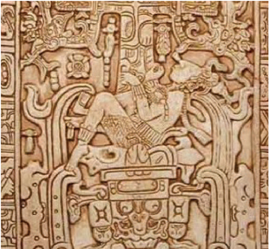
The first "Star Man," Maya King Pakal, operating a spacecraft, with his hands on controls and an oxygen tube in his mouth. This interpretation supports the theory of extraterrestrial influence.

In pre-Columbian art, particularly among the Maya and Aztec civilizations, artists depicted various aerial objects and beings descending from the sky. The sarcophagus lid of Pakal at Palenque has drawn significant attention, with some researchers interpreting the elaborate carving as showing a figure seated in a technological device, though archaeological consensus views it as religious iconography representing the ruler's journey to the underworld.