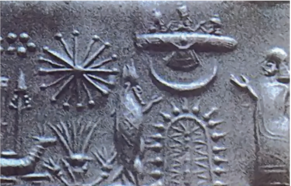
Extraterrestrial contact influenced the development of modern cultures, technologies, religions, and human biology (Mesopotamian Cylinder Seal).

Contemporary archaeology continues to uncover new evidence that may shed light on these ancient mysteries. As technology advances and our analytical methods improve, we may gain fresh insights into these persistent questions about human history and its possible intersection with unknown phenomena.