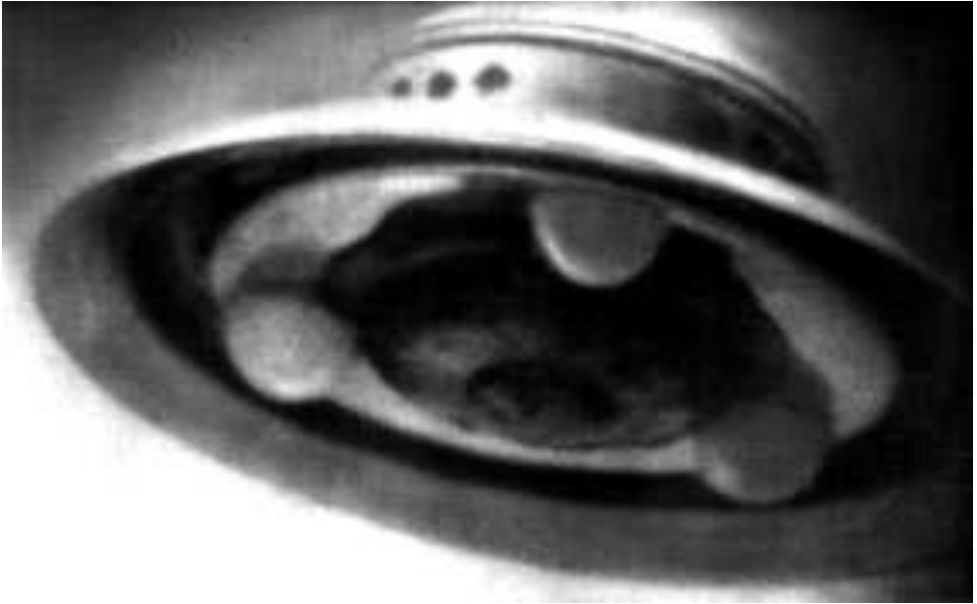
George Adamski photo of a UFO taken on December 13, 1952.

the 1950s, the contactee movement has left an indelible mark on both UFO studies and popular culture.