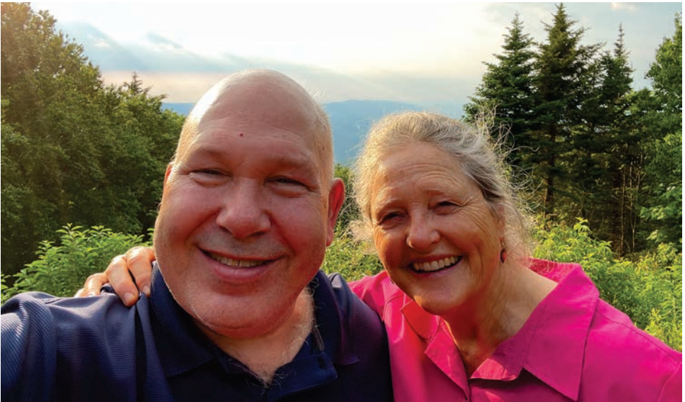
This is where we saw the silver orb UFO on our third date in 2013.