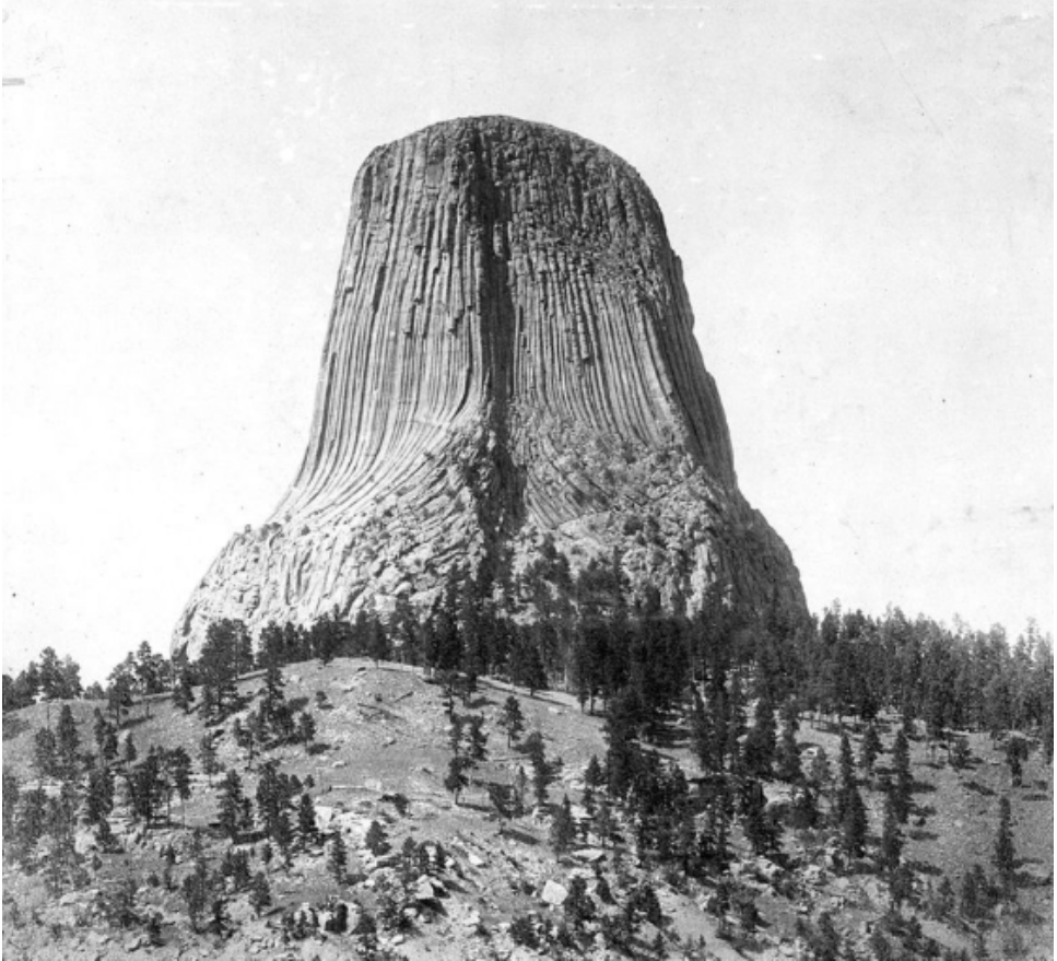
Native American legends focus on the the spiritual ties of Devils Tower in Wyoming to the Pleiades and extraterrestrial visitors.

wisdom about living in harmony with nature and understanding humanity's place in the cosmos offers valuable perspectives for addressing modern crises.