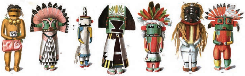
Star People are known as Kachinas by the Hopi.

In Hopi tradition, the Star People are known as Kachinas, who serve as intermediaries between the human world and the spirit realm. Their prophecies speak of cycles of civilization and describe times when the Star People would return to help guide humanity through important transitions.