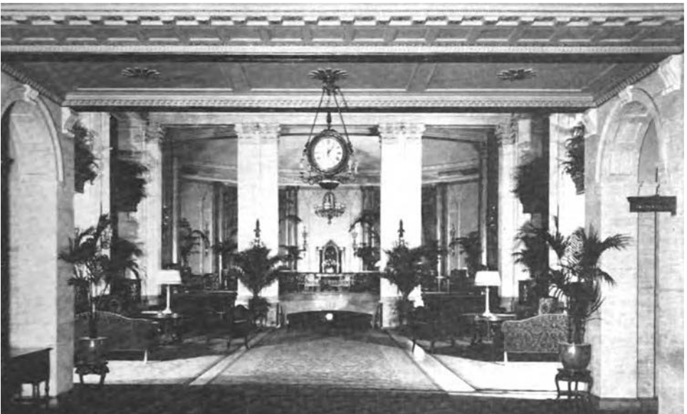
This is an old photo of the Roosevelt Hotel lobby at 45 East 45th Street.

While those UFO sightings were great, my most amazing extraterrestrial experience was in New York City in 1992. I received a telepathic message from a man who was walking through the lobby of the Roosevelt Hotel in midtown. He did not look alien in any way. He was crossing about 20 feet in front of me and telepathically confirmed that I had just made an excellent decision. His voice was so clear and friendly. He then told me he was from the Pleiades as he continued across to the lobby stairs and out of sight. It lasted no more than 10 seconds.