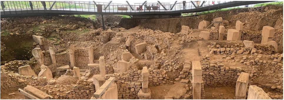
The oldest existing temple site in the world, Göbekli Tepe, in southeastern Turkey, dating from 11,500 years ago.

The precision of ancient astronomical observations, recorded in various cultures, suggests careful sky-watching traditions that might have documented genuine anomalous phenomena alongside celestial events.