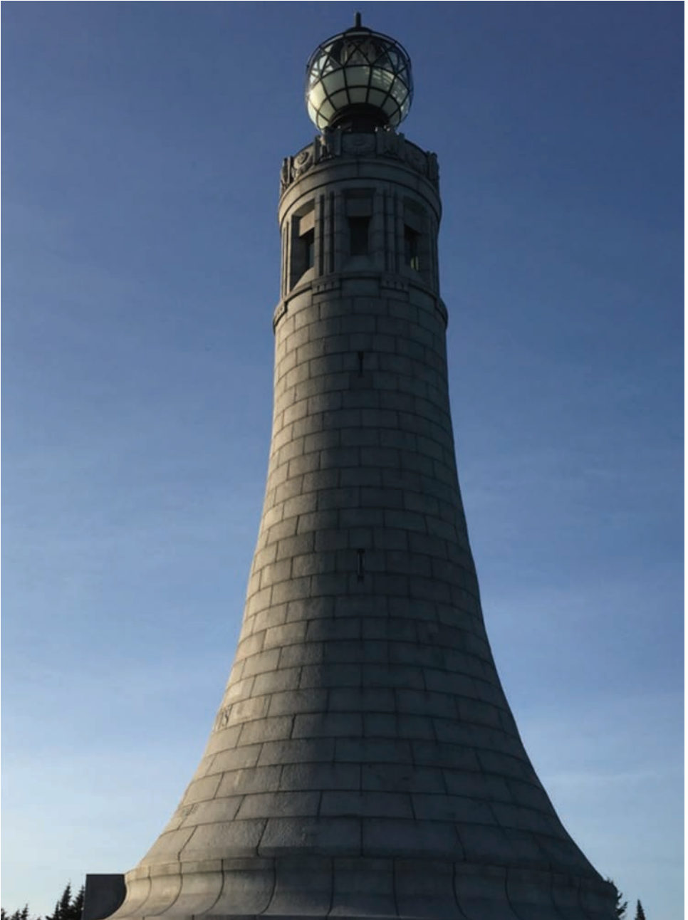
Mt. Greylock Tower is at the highest point in Massachusetts (3,489 ft.). There have been many orb UFO sightings (round & colorless) since 1947.