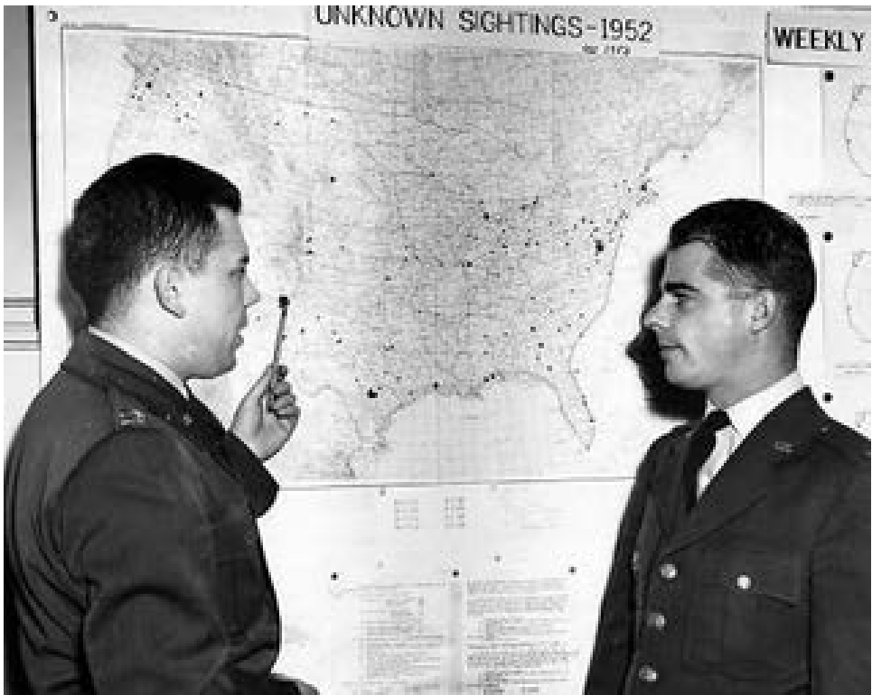
Captain Edward J. Ruppelt (left), head of Project Blue Book, at the Wright-Patterson Air Force Base project office in March 1953. While Project Blue Book focused on sighting reports, it did not specifically address “contactees”—individuals claiming direct encounters with extraterrestrials. The project’s emphasis was more on identifying aerial phenomena.

cultural and psychological movement. As humanity moves closer to potential confirmed extraterrestrial contact, the study of historical contactee claims may offer valuable insights into how societies process and integrate paradigm-shifting experiences.